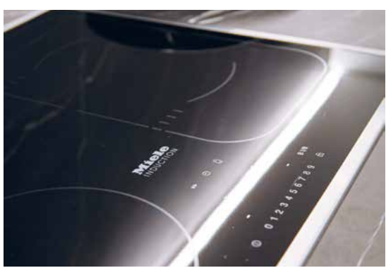
Miele 3 Zone Burners