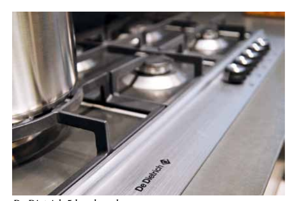
De Dietrich 5 head gas burners

AIRA Residence's bathroom is created to be a quiet place full of harmony and aesthetics. It is a personal place of pampering for the residents. The beautiful en suite Master Bathroom is fitted with the decadent Cocoon bath tub, Cocoon Piet Boon rain shower head, Duravit water closet and complemented with Formani's "Nordic European" design door handles.