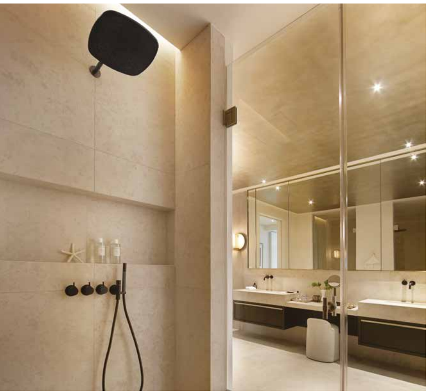
Cocoon Piet Boon Rain Shower Head and Vola branded fittings